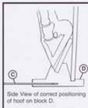
Side View of correct positioning of hoof on block D.